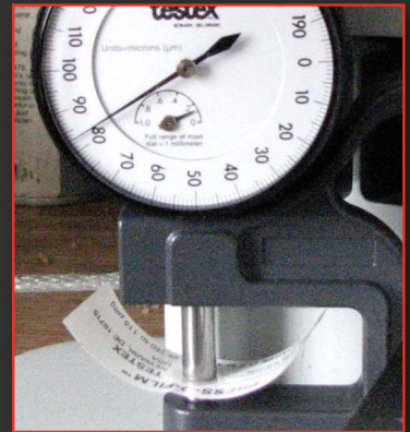
• 83 R 2 (3.3 mil)