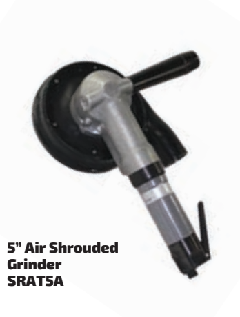
5" Air Shrouded Grinder SRAT5A