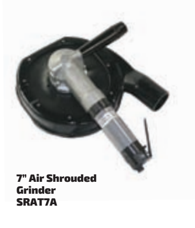
7" Air Shrouded Grinder SRAT7A

Novatek's Dust-Free Grinders/Sanders are built for the most demanding applications. Grind steel or concrete virtually dust free. Multiple disks and power configurations allow for an exact configuration to suit your project.