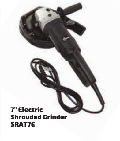
7" Electric Shrouded Grinder SRAT7E