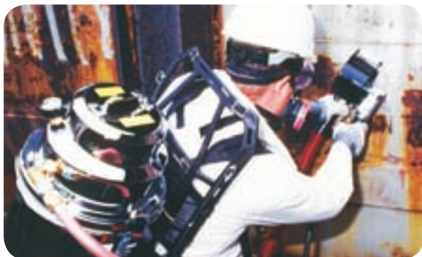
Air Backpack model with RotoPeen tool removing rust from a steel structure.