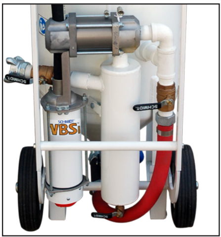
VBSII on the back of a Schmidt Abrasive Blaster

The Schmidt VBS II™ is the latest technology for suppressing the intensity of the air/energy during vessel depressurization of abrasive blasting systems. It is the only system specifically designed to safely reduce the noise levels and abrasive particle velocity (speeds) which occur during vessel blowdown.